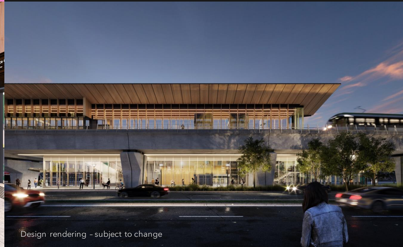
Design rendering - subject to change

A nighttime image of the station, highlighting how transparency supports wayfinding. The spaces under the elevated guideways will be illuminated for safety and amenity.