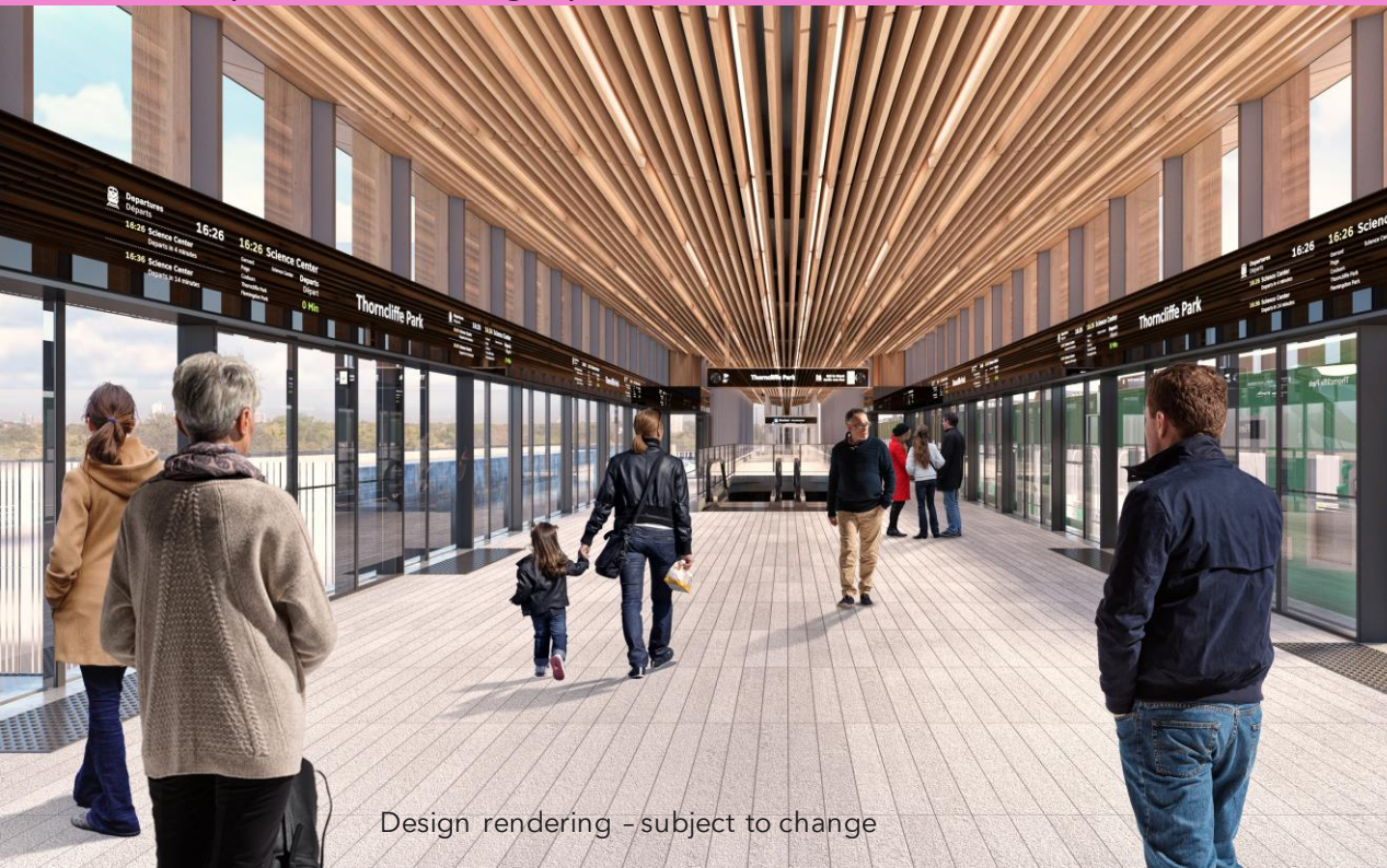
Design rendering - subject to change