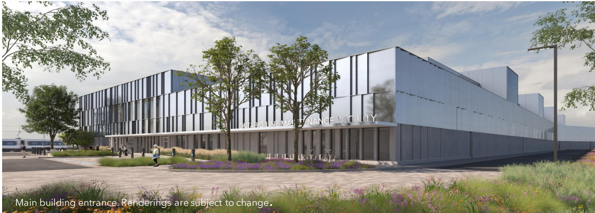
Main building entrance. Renderings are subject to change.

Those working at the OMSF location will oversee operations of the line, signaling and communications maintenance, line security, safety, performance management, and track and train maintenance.